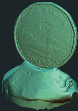
3D scan the tiny details of a coin